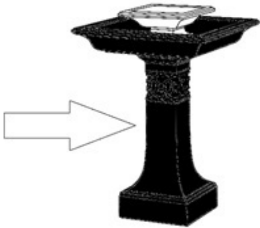
FT-214B (268 lbs) 26.5"L x 26.5"W x 36.75"H

Assemble your fountain on a level surface capable of holding a minimum of 325 pounds with an approximate 1 square foot footprint.